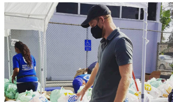
Prince Harry , Duke of Sussex, recently joined the Platoon to pack meal kits alongside veteran volunteers.